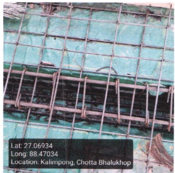
Roof Beam Mid Span Top Support Image