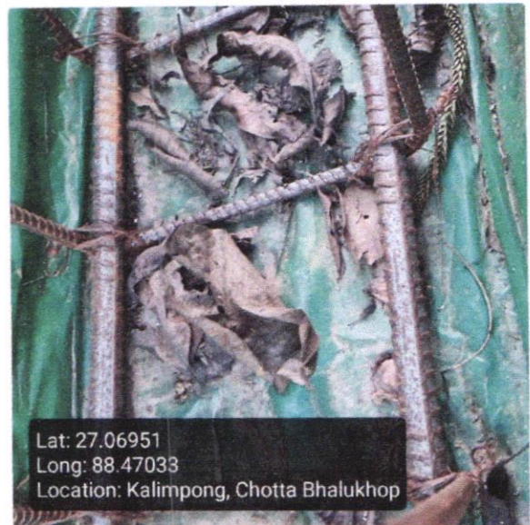
Roof Beam Mid Span Top Support (16 mm dia 2 nos)