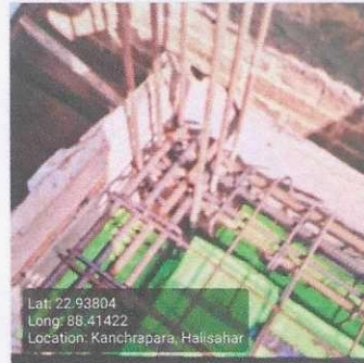
Roof Beam Top Support Image