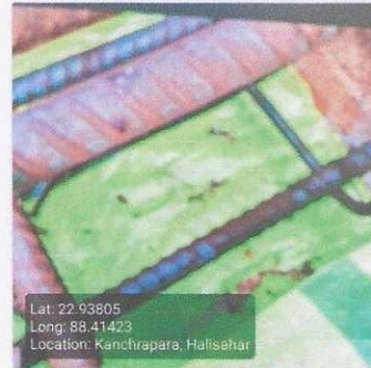
Roof Beam Bottom Support Image