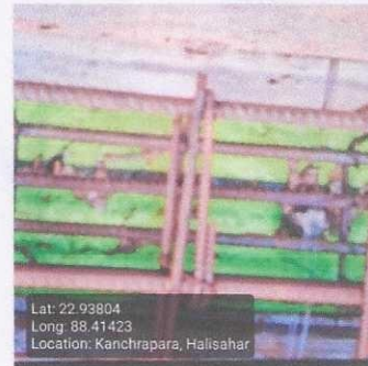
Roof Beam Mid Span Top Support Image