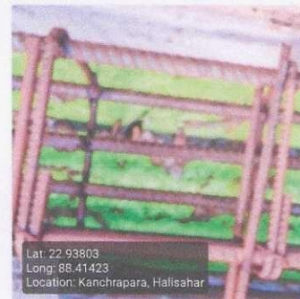
Roof Beam Mid Span Bottom Support Image