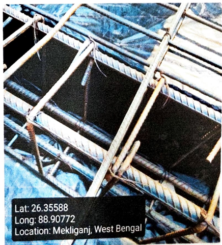
Roof Beam Mid Span Bottom Support (16 mm dia 4 nos)