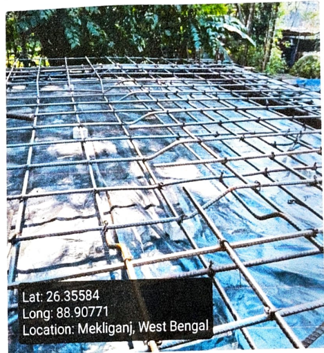
Binder for Roof Beam Support (250mm X 250mm)