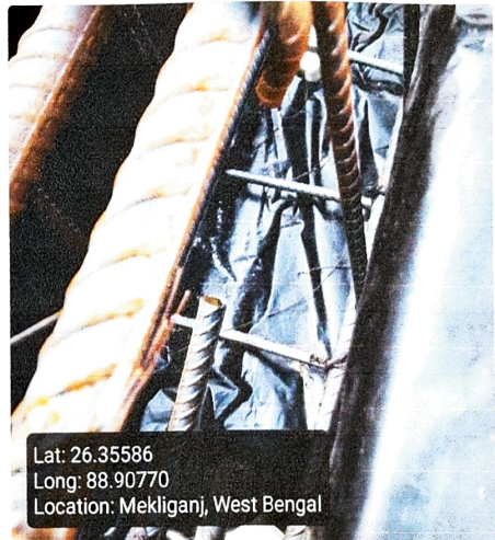
Roof Beam Mid Span Top Support (16 mm dia 2 nos)