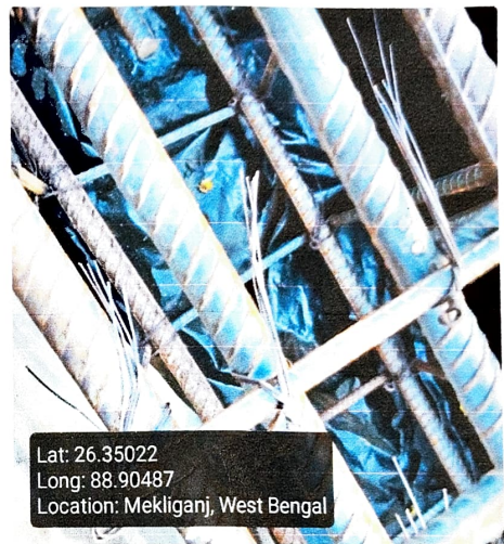
Roof Beam Mid Span Top Support (16 mm dia 2 nos)