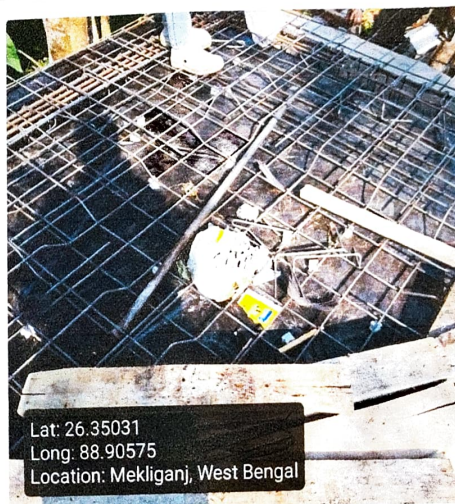
Binder for Roof Beam Support (250mm X 250mm)