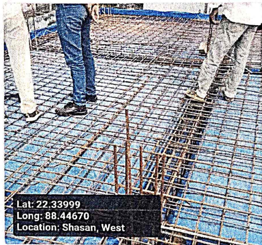
Binder for Roof Beam Support (250mm X 250mm)