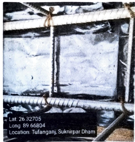
Roof Beam Mid Span Top Support (16 mm dia 2 nos)