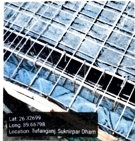
Roof Beam Mid Span Bottom Support (16 mm dia 4 nos)