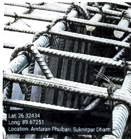
Roof Beam Mid Span Bottom Support (16 mm dia 4 nos)