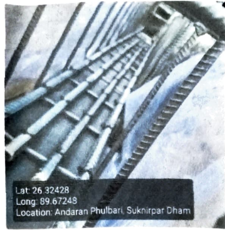
Roof Beam Mid Span Bottom Support Image

Roof Details Parameters (8 mm dia 125 nos)