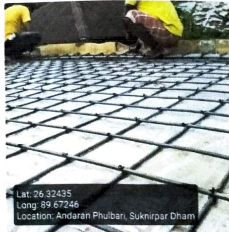
Roof Details Parameters Image

Binder for Roof Beam Support (250mm X 250mm)