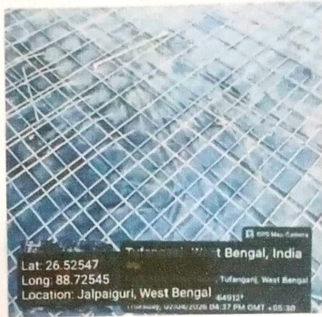
Binder for Roof Beam Support (250mm X 250mm)