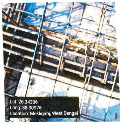
Roof Beam Bottom Support (16 mm dia, 2 nos.)