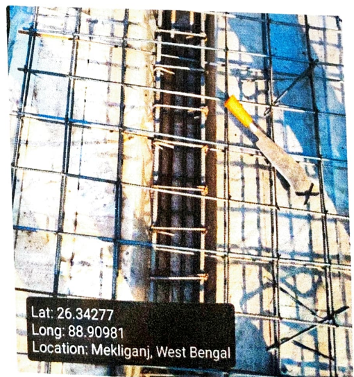
Roof Beam Mid Span Bottom Support (16 mm dia 4 nos)