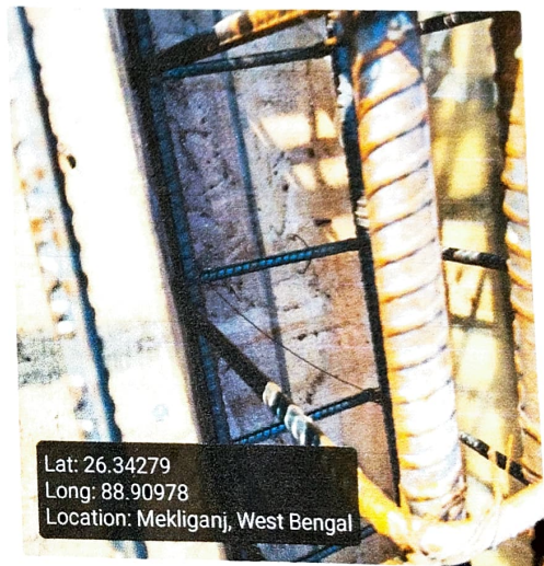
Roof Beam Mid Span Top Support (16 mm dia 2 nos)