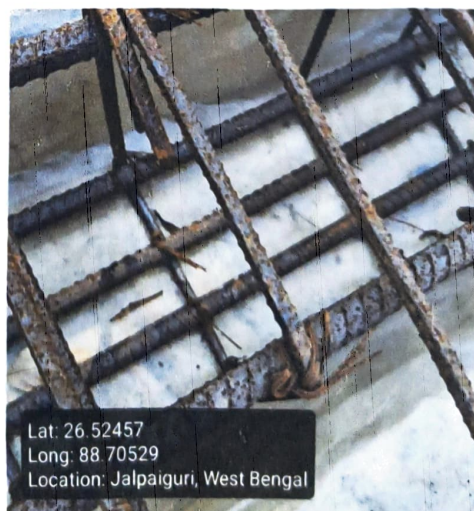
Roof Beam Mid Span Bottom Support (16 mm dia 4 nos)