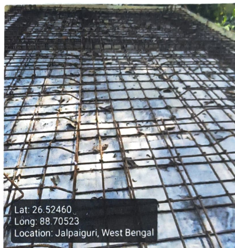
Binder for Roof Beam Support (250mm X 250mm)