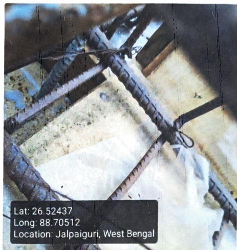
Roof Beam Mid Span Top Support (16 mm dia 2 nos)