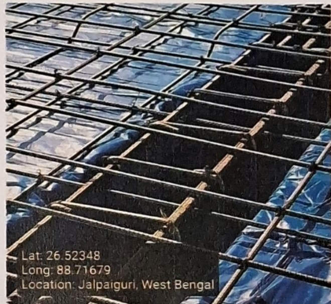
Roof Beam Mid Span Bottom Support (16 mm dia 4 nos)