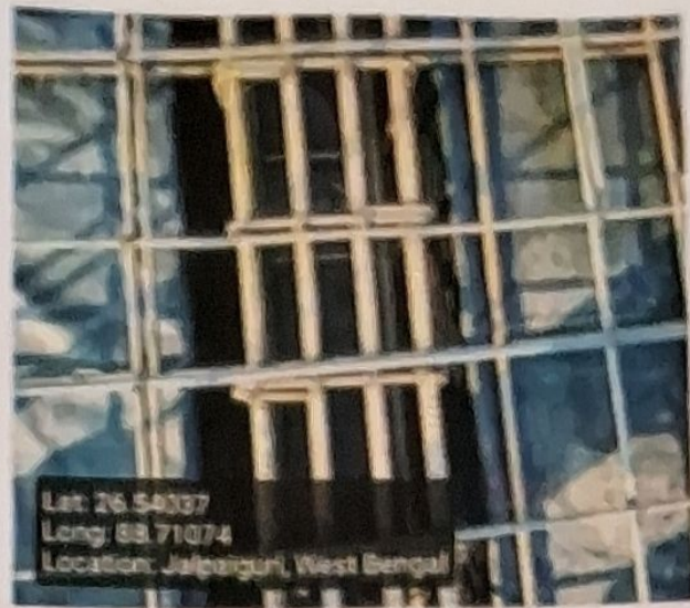
Roof Beam Bottom Support (16 mm dia, 2 nos.)