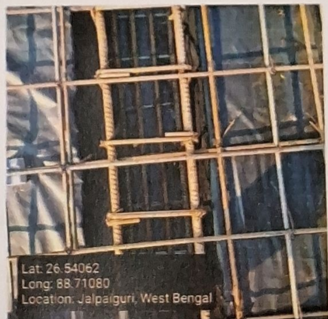
Roof Beam Mid Span Bottom Support (16 mm dia 4 nos)