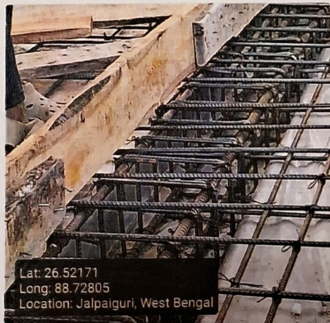
Roof Beam Mid Span Bottom Support (16 mm dia 4 nos)