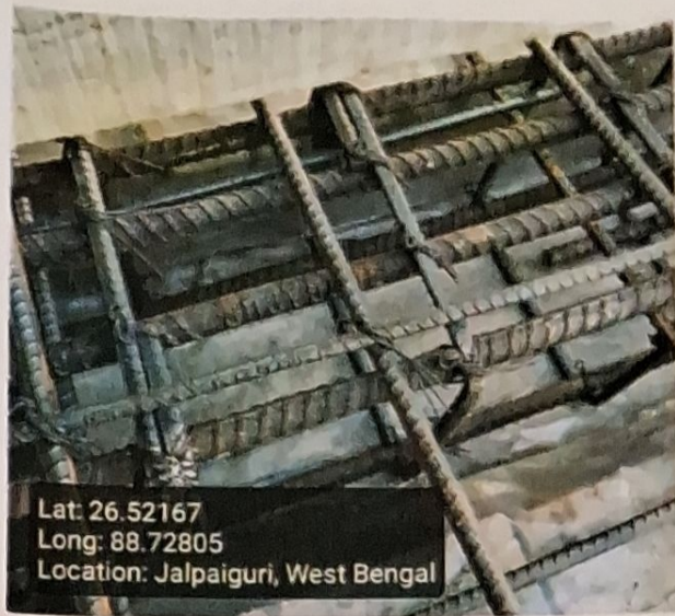
Roof Beam Bottom Support (16 mm dia, 2 nos.)