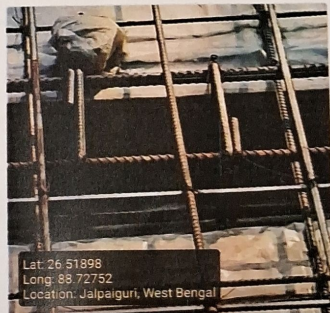
Roof Beam Mid Span Bottom Support (16 mm dia 4 nos)