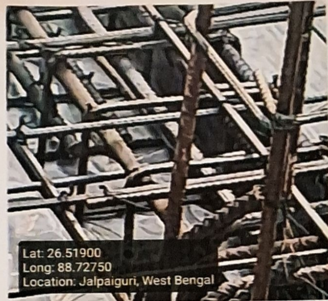
Roof Beam Mid Span Top Support (16 mm dia 2 nos)