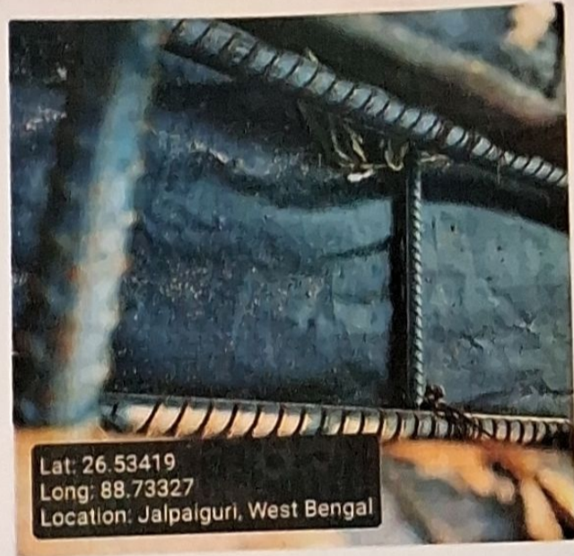
Roof Beam Mid Span Top Support (16 mm dia 2 nos)