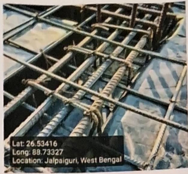
Roof Beam Bottom Support (16 mm dia, 2 nos.)