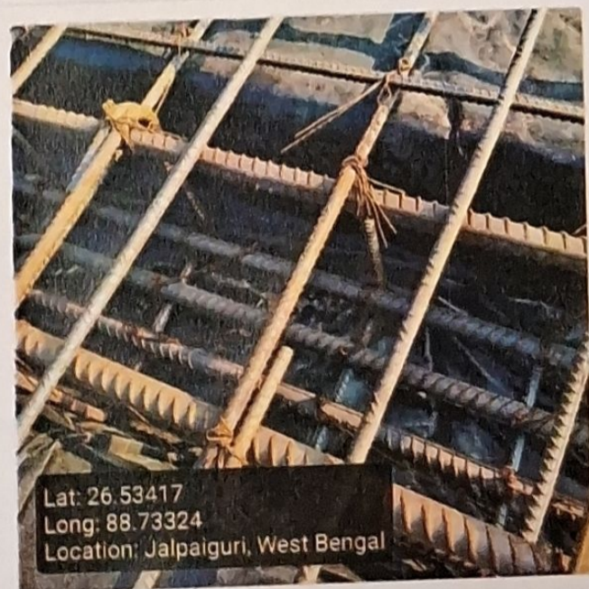
Roof Beam Mid Span Bottom Support (16 mm dia 4 nos)