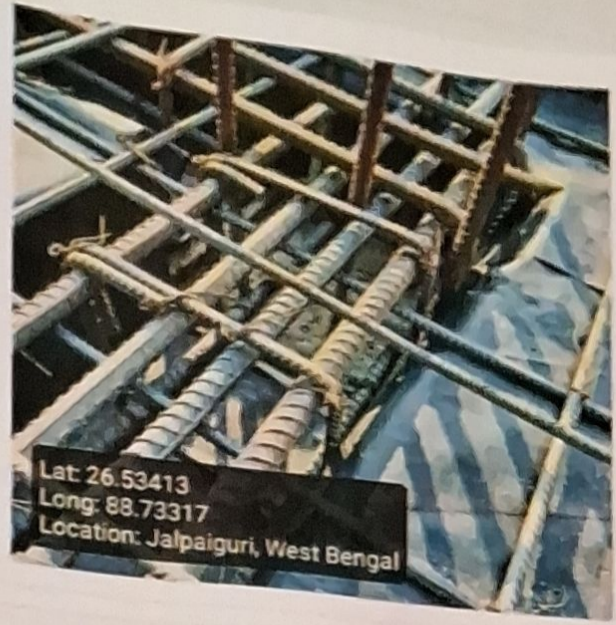
Roof Beam Bottom Support (16 mm dia, 2 nos.)