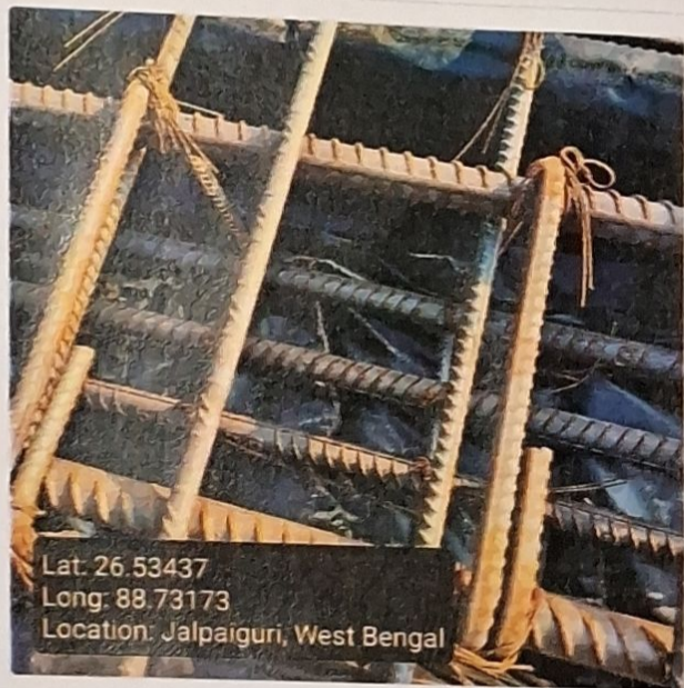
Roof Beam Mid Span Top Support Image