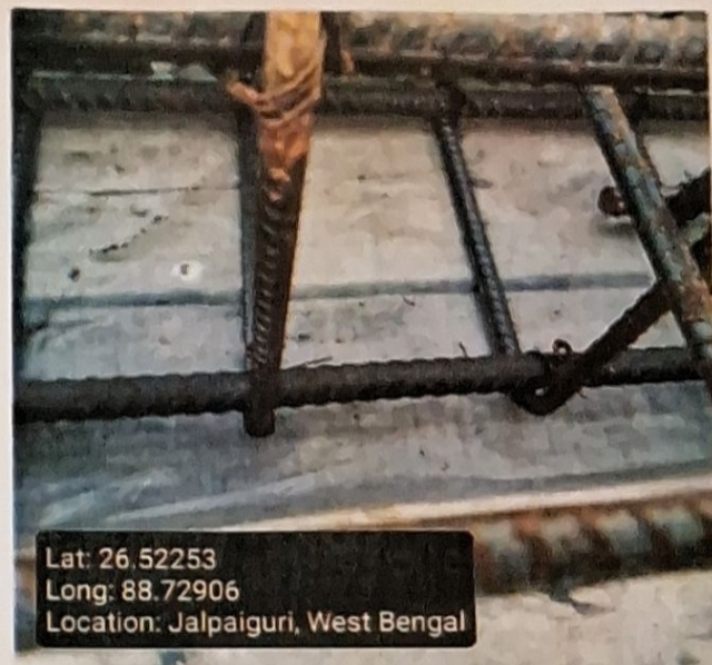
Roof Beam Mid Span Top Support (16 mm dia 2 nos)