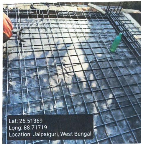
Roof Details Parameters Image

Binder for Roof Beam Support (250mm X 250mm)