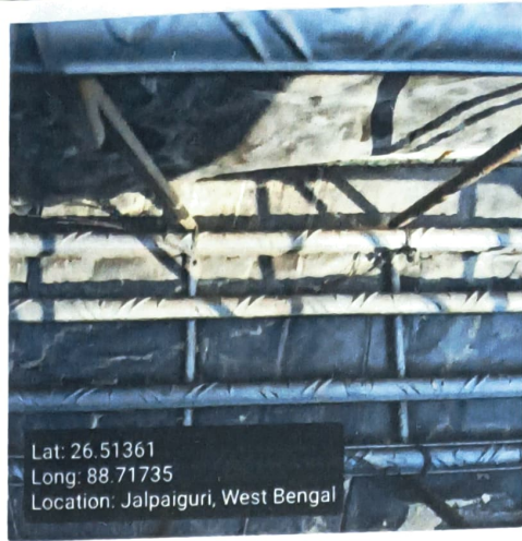
Roof Beam Mid Span Bottom Support Image

Roof Details Parameters (8 mm dia 125 nos)