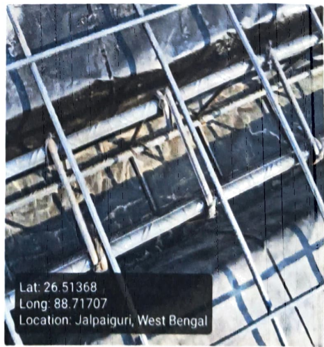
Roof Beam Mid Span Bottom Support (16 mm dia 4 nos)