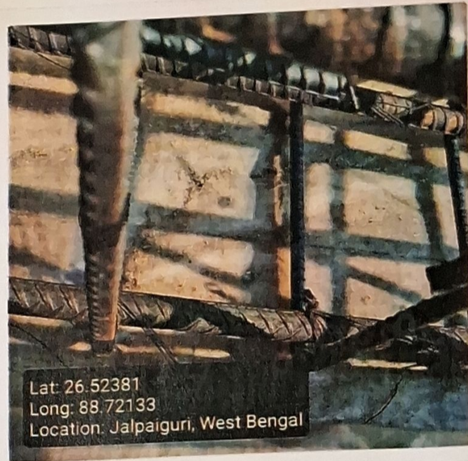
Roof Beam Mid Span Top Support (16 mm dia 2 nos)