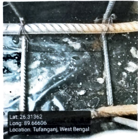
Roof Beam Mid Span Top Support (16 mm dia 2 nos)