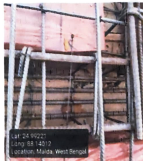
Roof Beam Mid Span Top Support Image