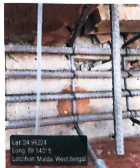
Roof Beam Mid Span Bottom Support Image