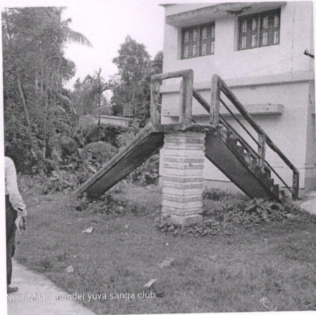
Near Milan monder yuva sanga club