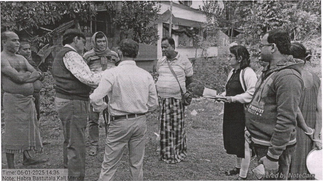
Time: 06-01-2025 14:36 Note: Habra Bastutala Kali Mandir