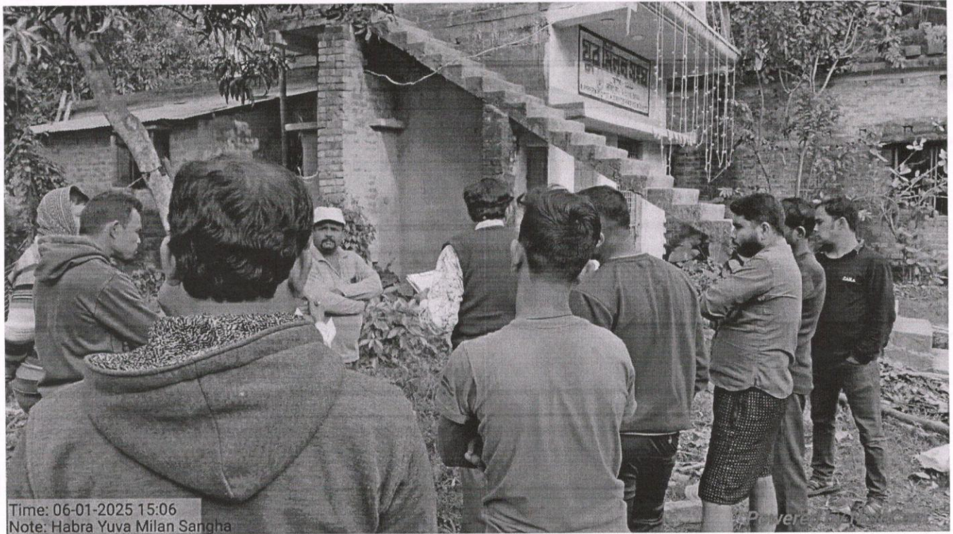
Time: 06-01-2025 15:06 Note: Habra Yuva Milan Sangha