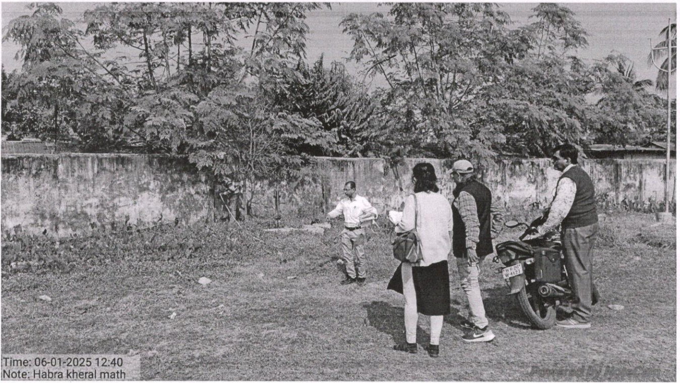
Time: 06-01-2025 12:40 Note: Habra kheral math