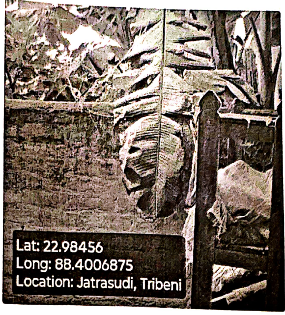
Lat: 22.98456 Long: 88.4006875 Location: Jatrasudi, Tribeni