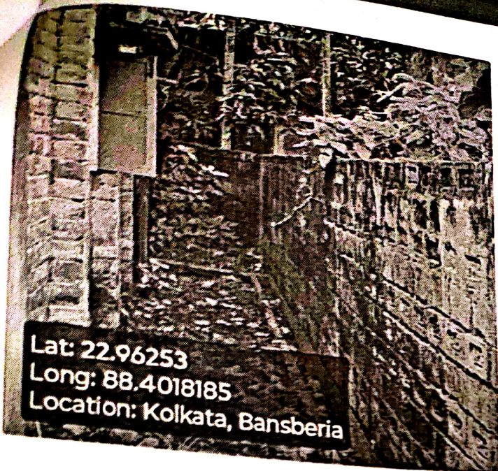
Lat: 22.96253 Long: 88.4018185 Location: Kolkata, Bansberia