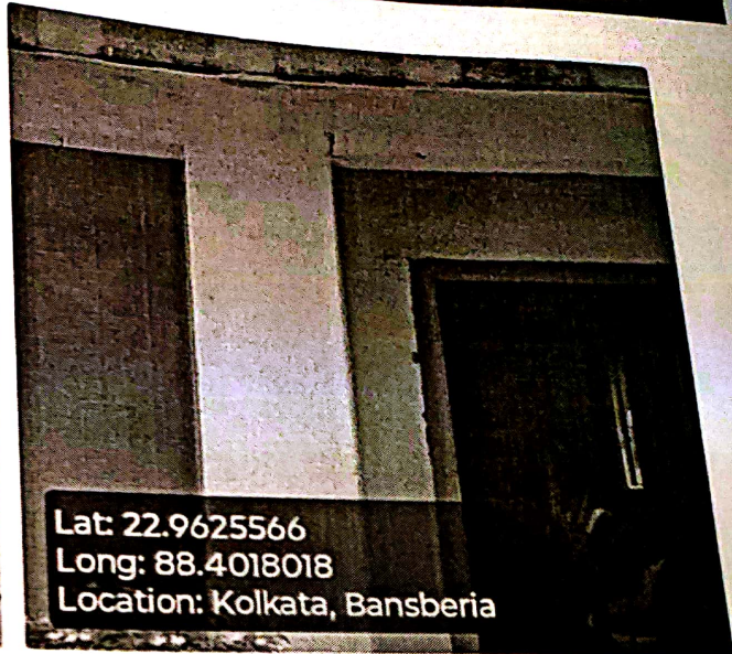
Lat: 22.9625566 Long: 88.4018018 Location: Kolkata, Bansberia