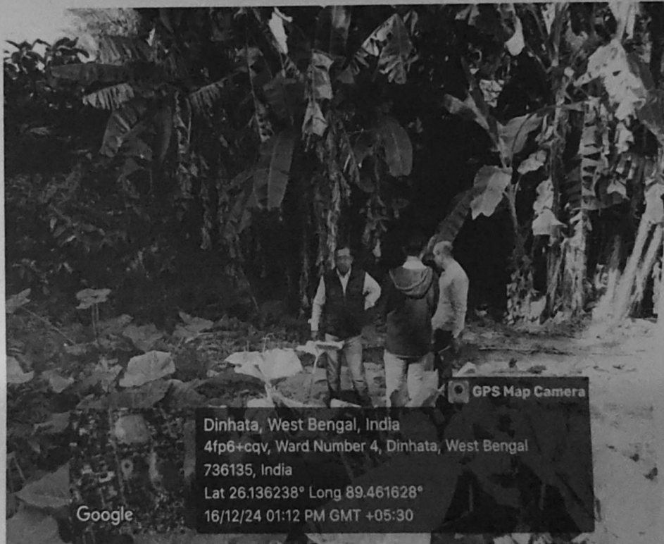
Dinhata High School

[Signature] Sub Assistant Engineer Dinhata Municipality