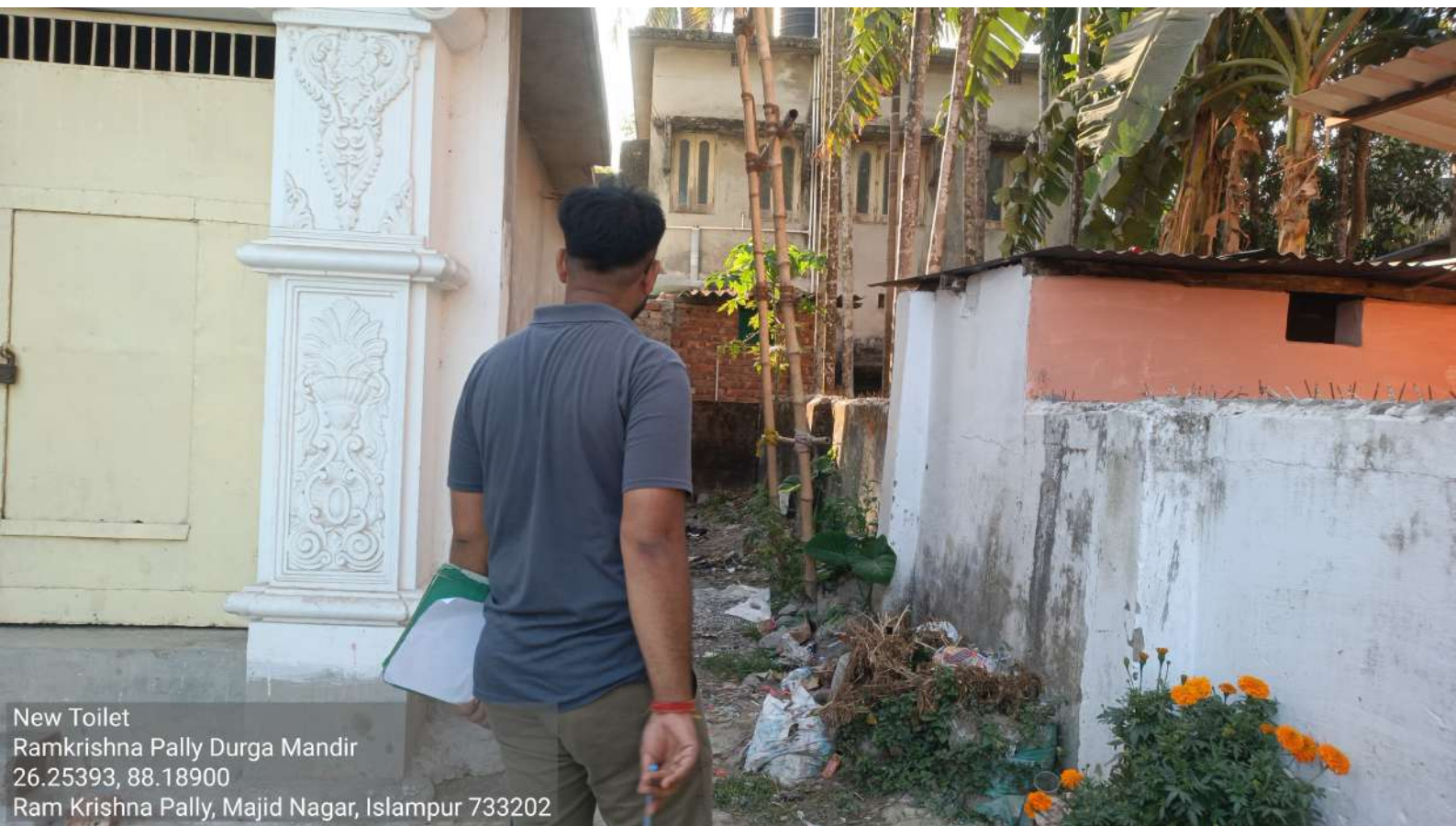
New Toilet Ramkrishna Pally Durga Mandir 26.25393, 88.18900 Ram Krishna Pally, Majid Nagar, Islampur 733202