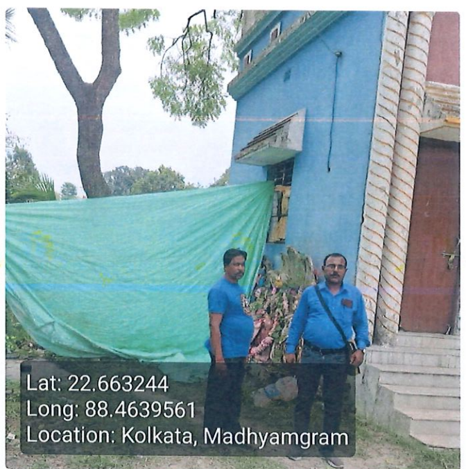
Lat: 22.663244 Long: 88.4639561 Location: Kolkata, Madhyamgram