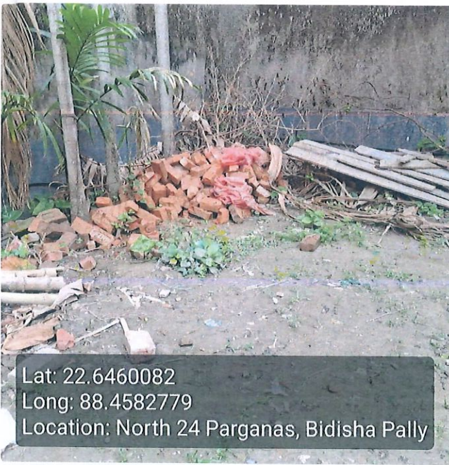
Lat: 22.6460082 Long: 88.4582779 Location: North 24 Parganas, Bidisha Pally