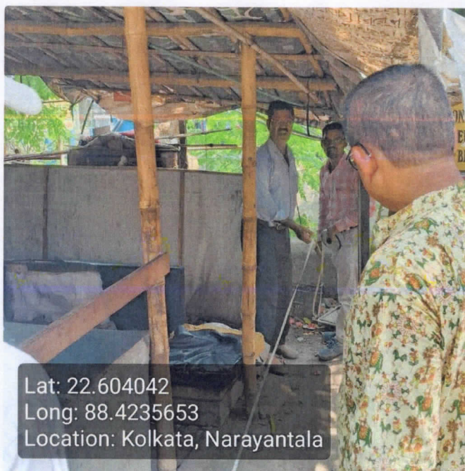
Lat: 22.604042 Long: 88.4235653 Location: Kolkata, Narayantala