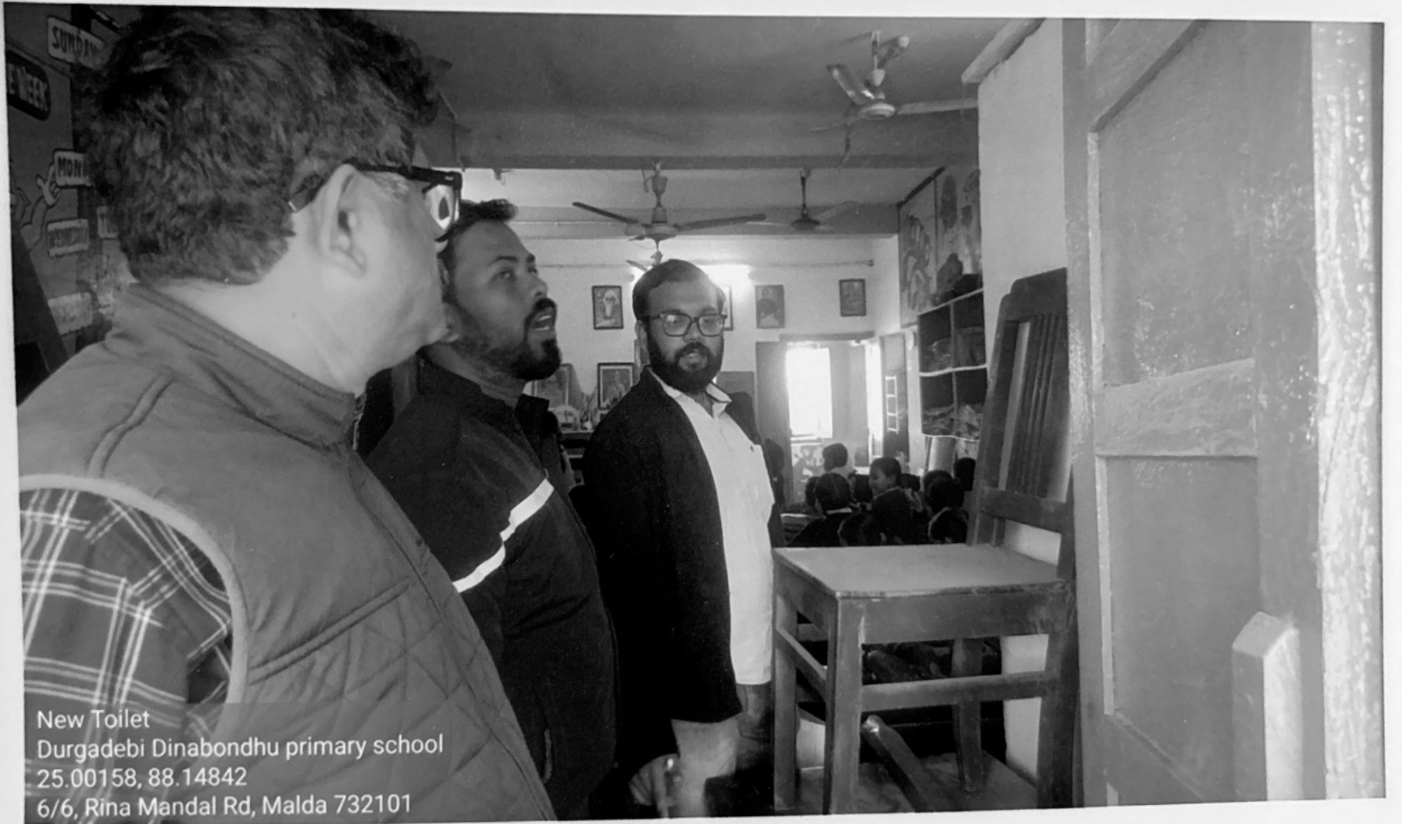
New Toilet Durgadebi Dinabondhu primary school 25.00158, 88.14842 6/6, Rina Mandal Rd, Malda 732101