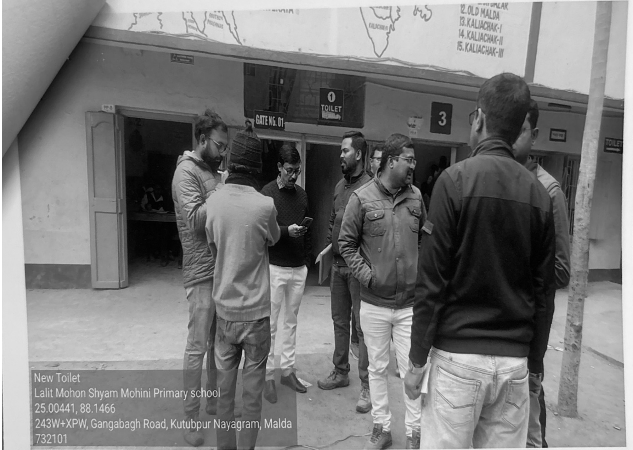
New Toilet Lalit Mohon Shyam Mohini Primary school 25.00441, 88.1466 243W+XPW, Gangabagh Road, Kutubpur Nayagram, Malda 732101