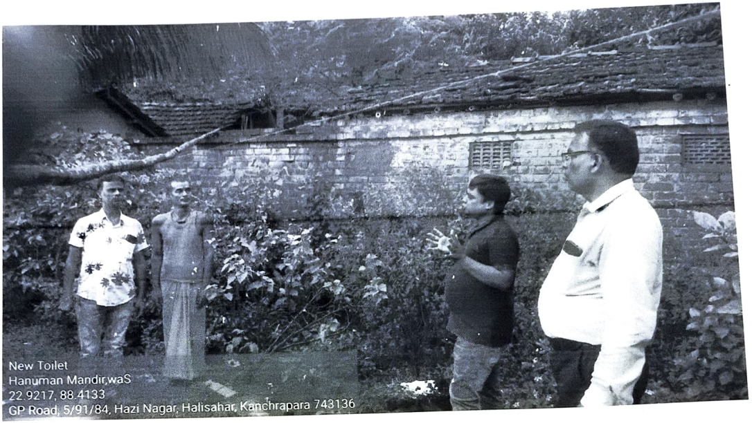
New Toilet Hanuman Mandir, waS 22.9217, 88.4133 GP Road, 5/91/84, Hazi Nagar, Halisahar, Kanchrapara 743136