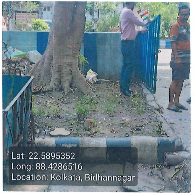
Lat: 22.5895352 Long: 88.4286516 Location: Kolkata, Bidhannagar