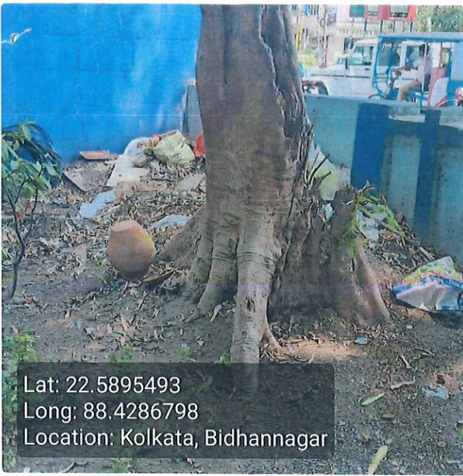
Lat: 22.5895493 Long: 88.4286798 Location: Kolkata, Bidhannagar