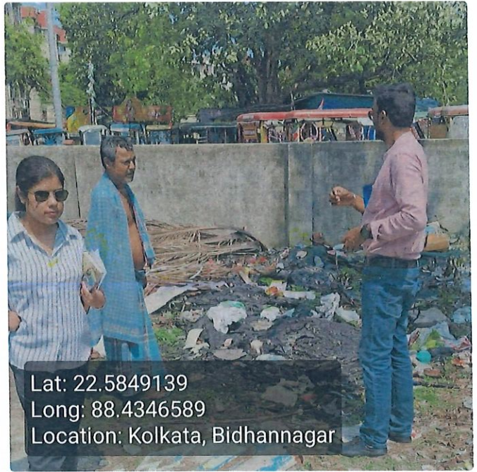
Lat: 22.5849139 Long: 88.4346589 Location: Kolkata, Bidhannagar