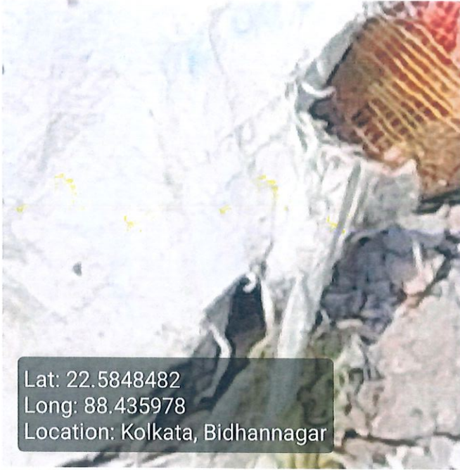
Lat: 22.5848482 Long: 88.435978 Location: Kolkata, Bidhannagar