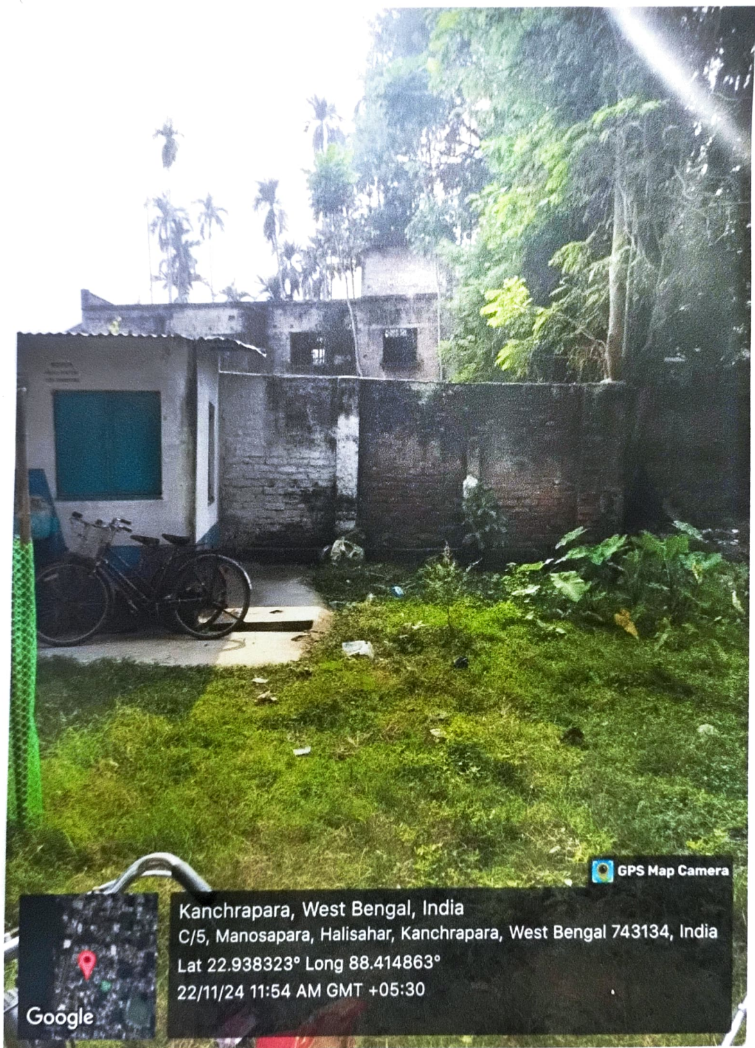
Halisahar High School & Primary School