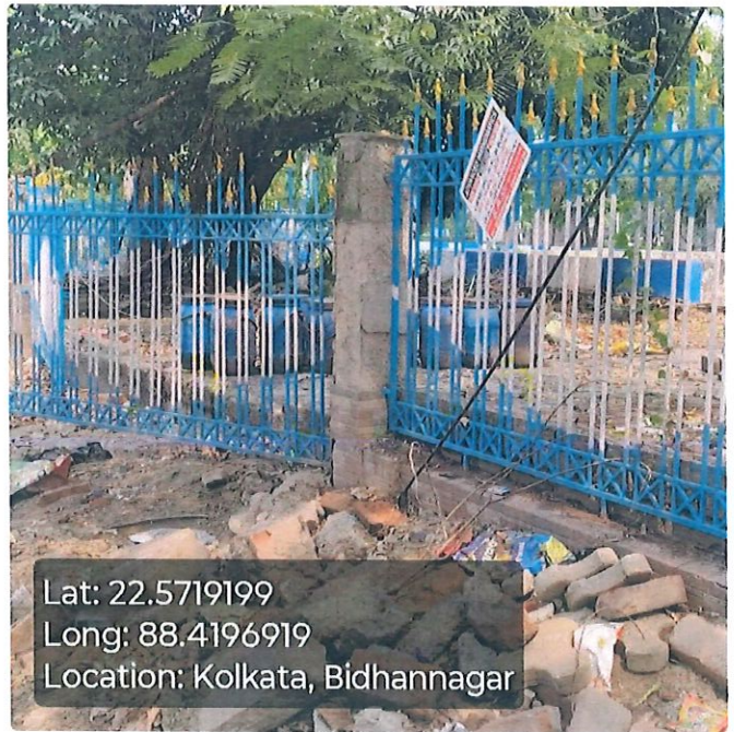
Lat: 22.5719199 Long: 88.4196919 Location: Kolkata, Bidhannagar