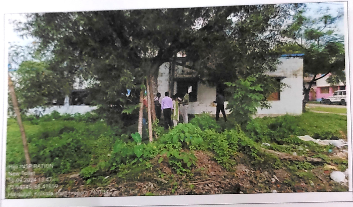
NABABHARATI G.S.F.P. SCHOOL