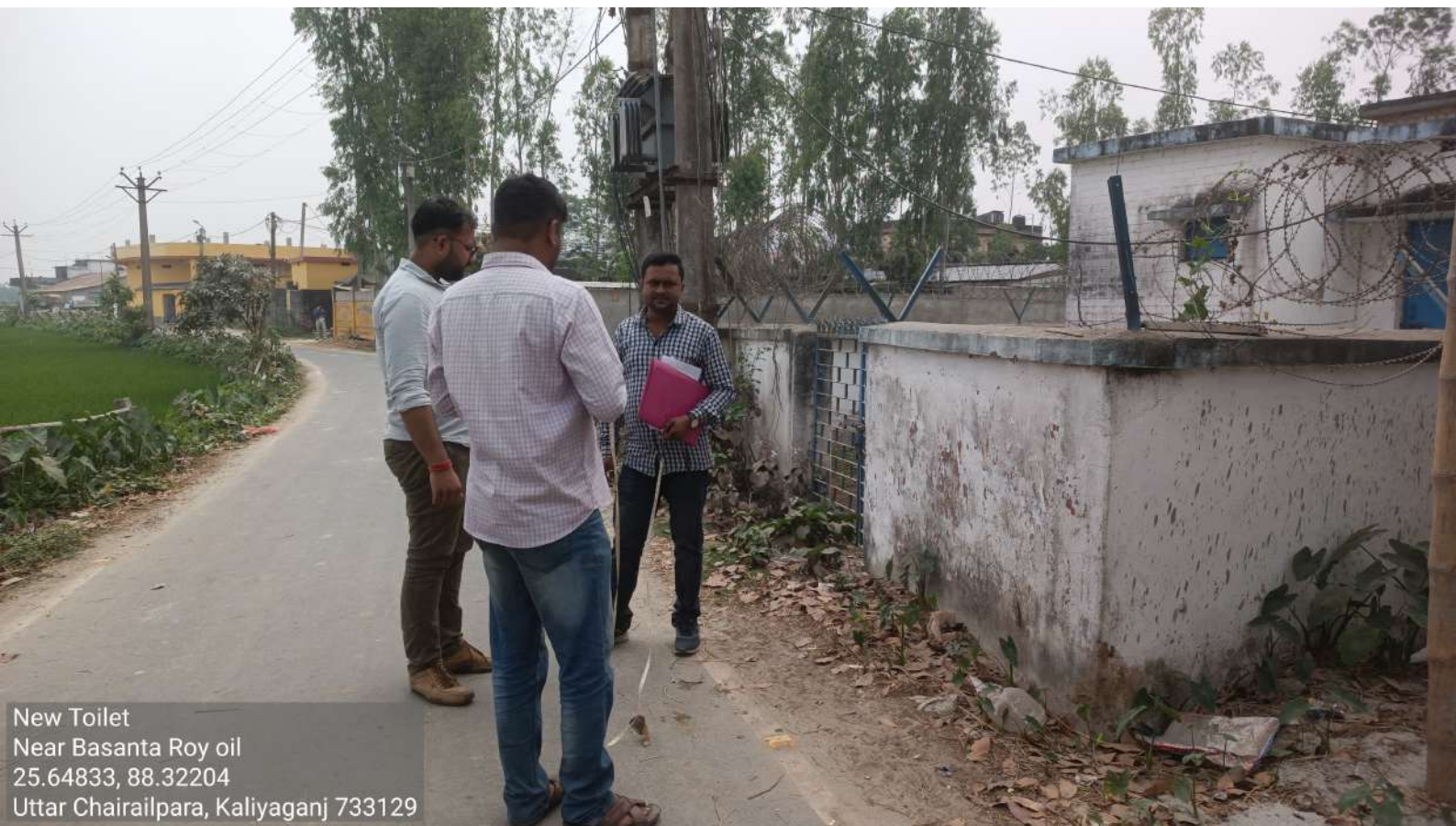
New Toilet Near Basanta Roy oil 25.64833, 88.32204 Uttar Chairailpara, Kaliyaganj 733129