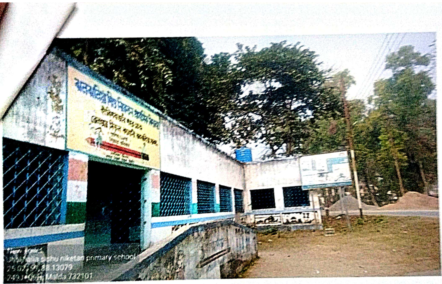
Shekh Hasina Pichu Niketan primary school 25.07.2024 88 13079 24934011 Malda 732101