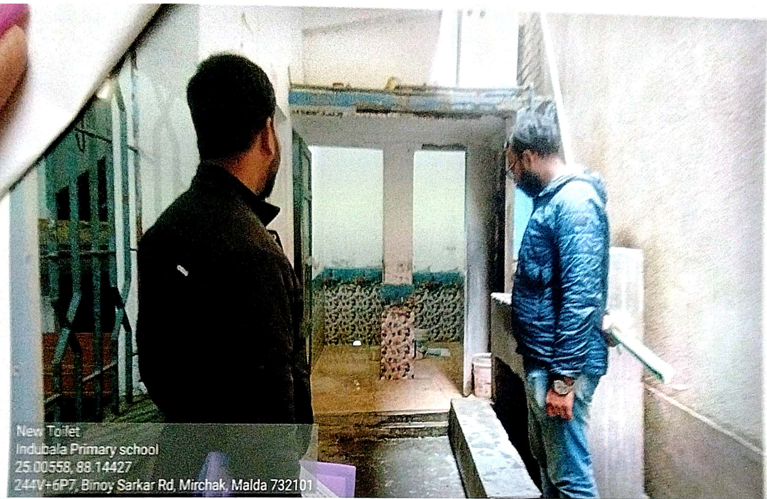
New Toilet Indubala Primary school 25.00558, 88.14427 244V+6P7, Binoy Sarkar Rd, Mirchak, Malda 732101