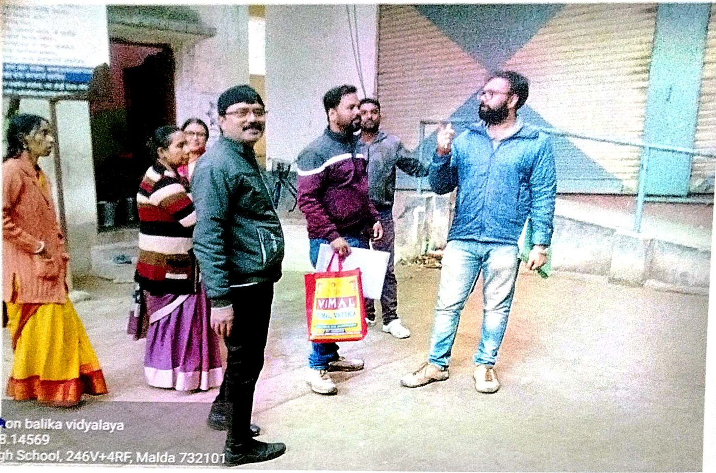
Kolkata on balika vidyalaya 8.14569 gh School, 246V+4RF, Malda 732101