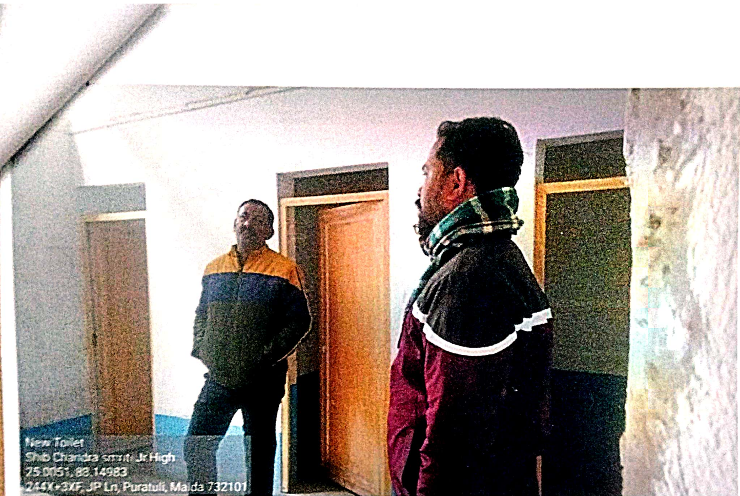
New Toilet Shib Chandra smriti Jr High 25.0051, 88.14983 244X+3XF, JP Ln, Puratuli, Malda 732101