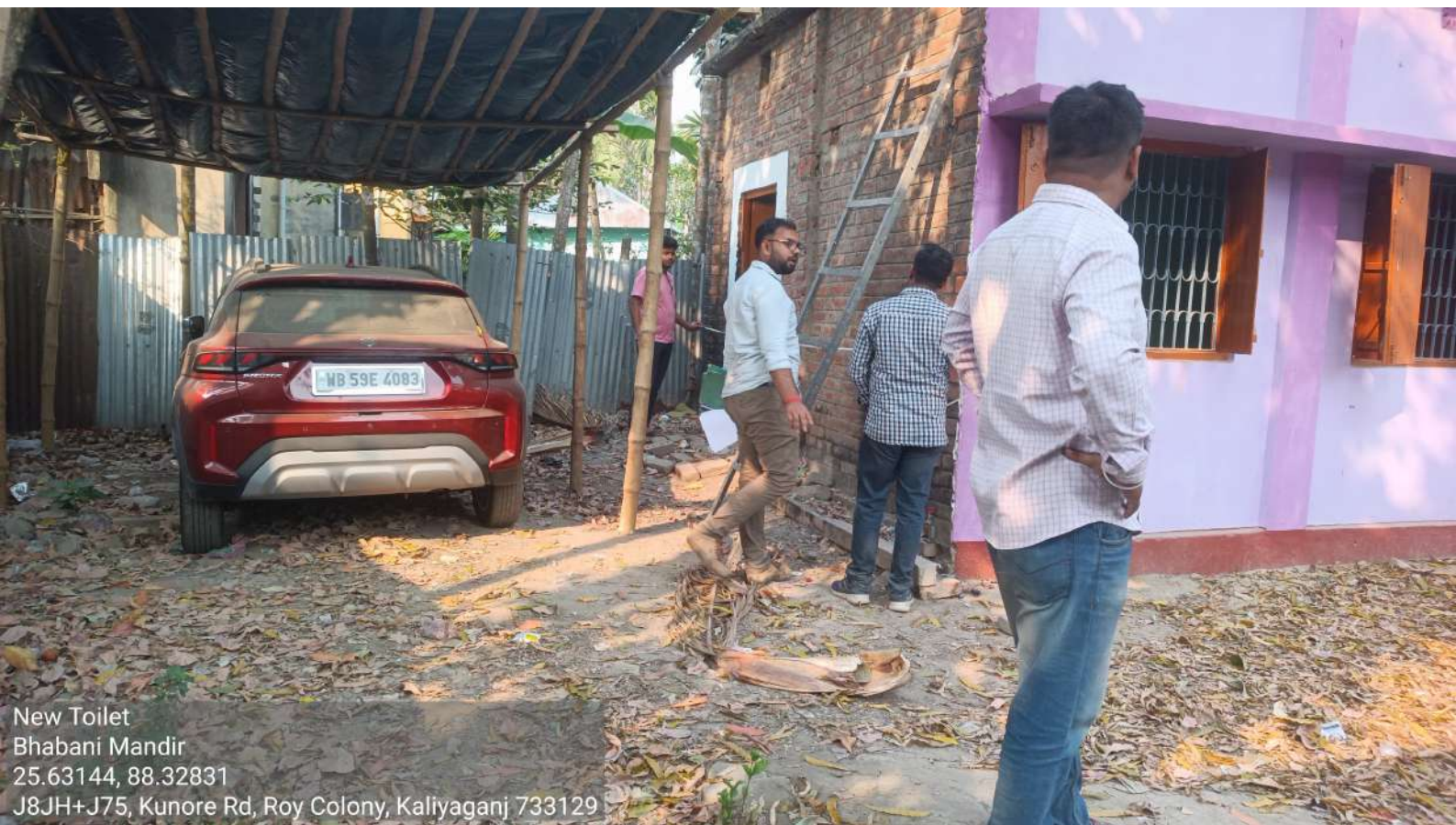
New Toilet Bhabani Mandir 25.63144, 88.32831 J8JH+J75, Kunore Rd, Roy Colony, Kaliyaganj 733129