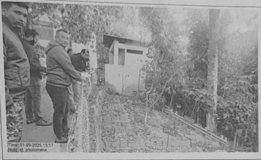
Time: 01-09-2025 15:17 Note: st. philomena