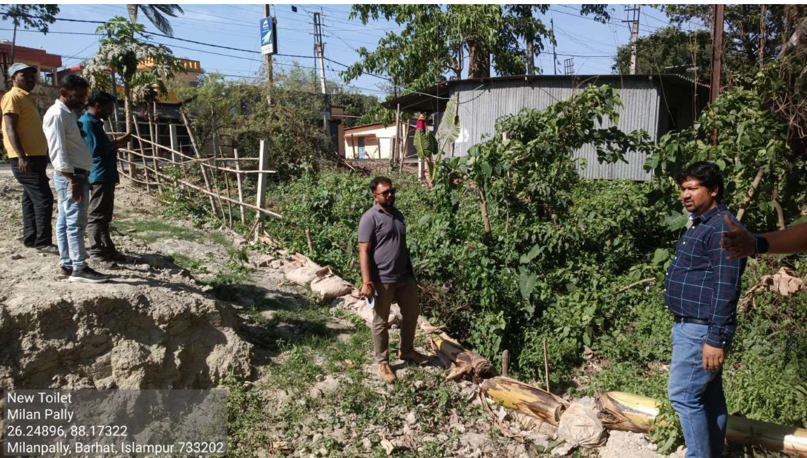
New Toilet Milan Pally 26.24896, 88.17322 Milanpally, Barhat, Islampur 733202