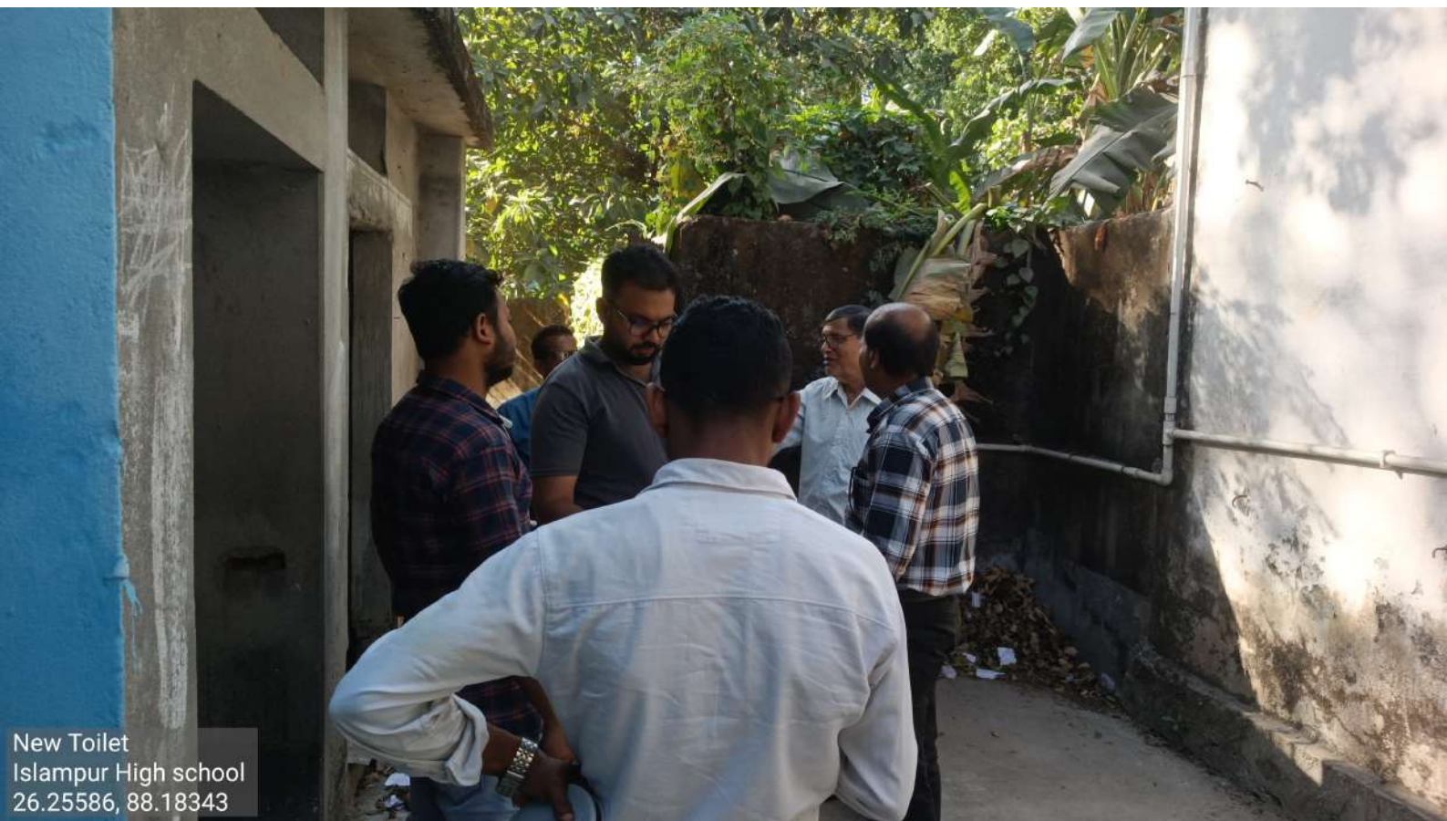
New Toilet Islampur High school 26.25586, 88.18343